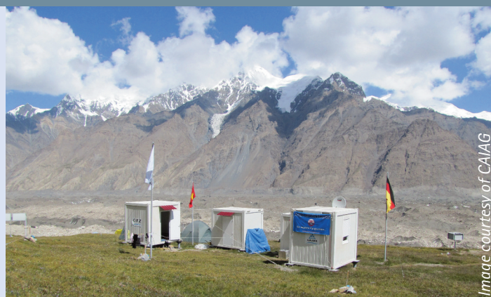
The Merzbacher monitoring station: a watchful eye on the Tien Shan glaciers.

The Gottfried Merzbacher Global Change Observatory, situated at an altitude of over 3000m in the Tien Shan glacier range in Kyrgyzstan, is at the forefront of monitoring and mitigating the impact of climate change. A joint venture between Kyrgyzstan's Central Asian Institute of Applied Geosciences (CAIAG) in Bishkek and the German Research Centre for Geosciences (GFZ) in Potsdam, it is an ideal platform for international monitoring projects, such as the EU-funded EURAS-CLIMPACT project, led by the University of Vienna, Austria, which studies the effects of climate change on glaciers in Austria, Sweden and Kyrgyzstan.